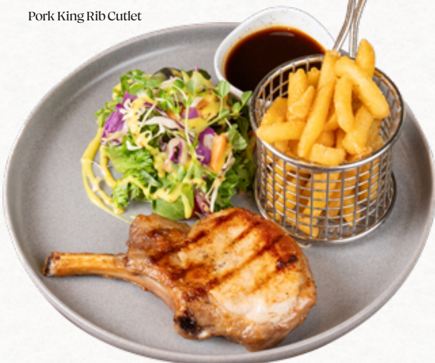
Pork King Rib Cutlet

Slow cooked Chicken marinated in genuine Portuguese seasonings, finished with a touch of peri-peri sauce.