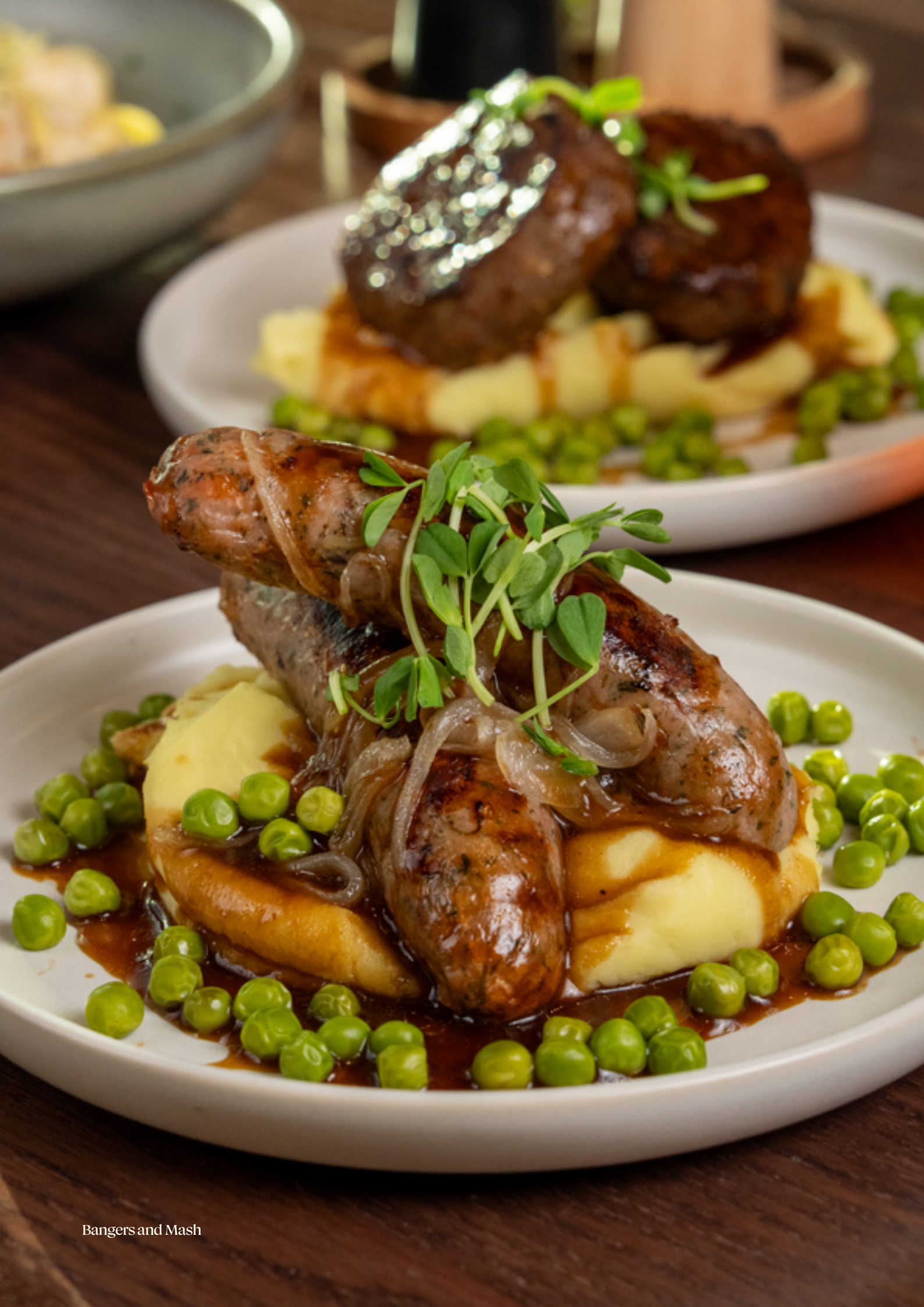
Bangers and Mash