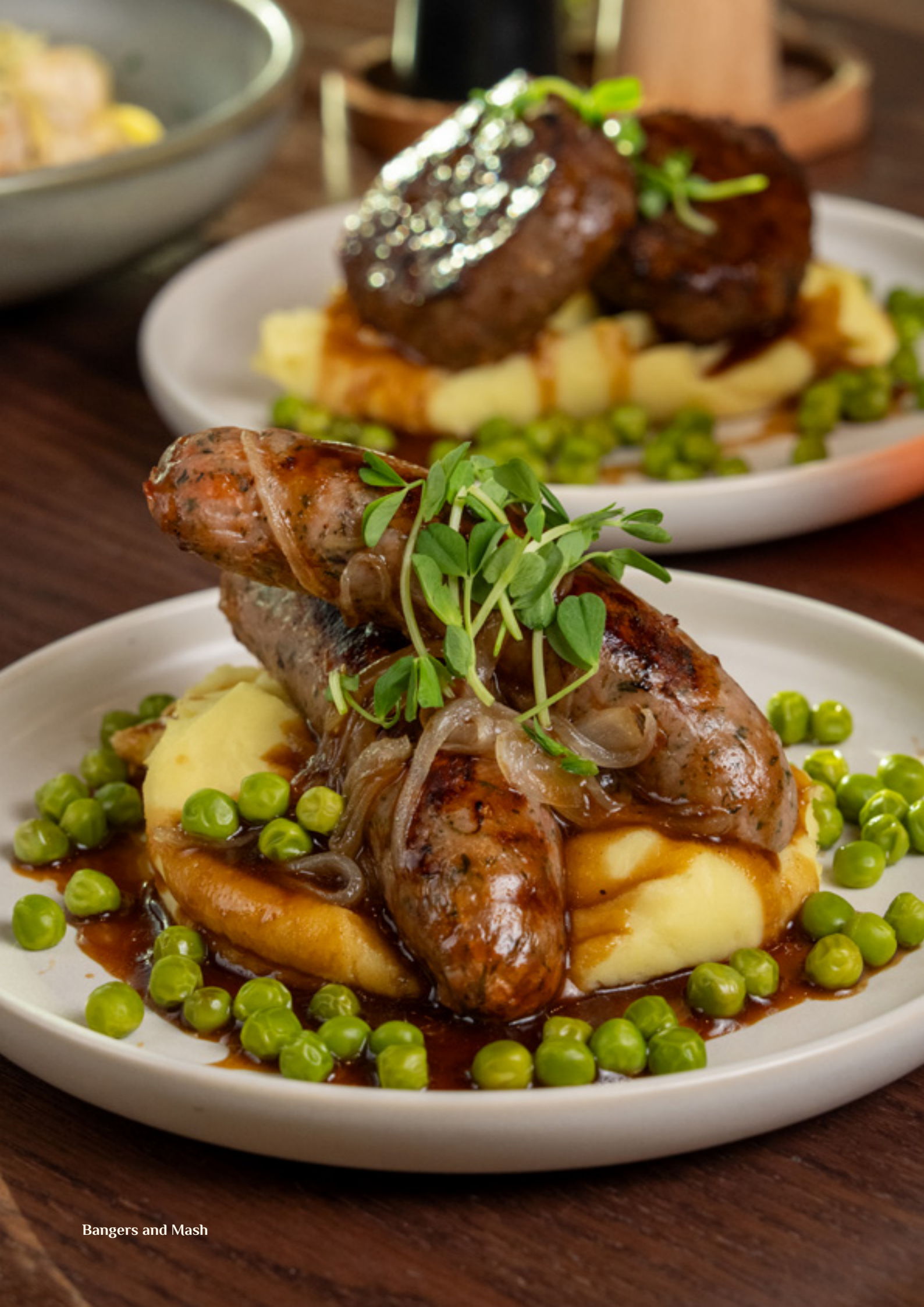
Bangers and Mash