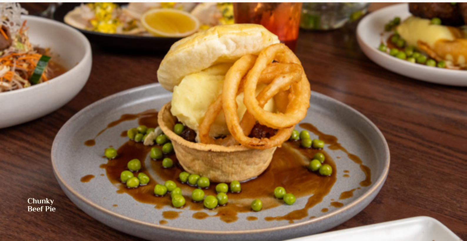
Chunky Beef Pie

Slow-cooked roast meat, served on a bed of crispy smashed potatoes with roasted pumpkin & steamed vegetables, a buttered dinner roll & finished with house-made rich red-wine gravy