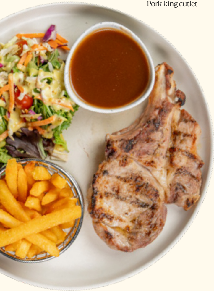
Pork king cutlet